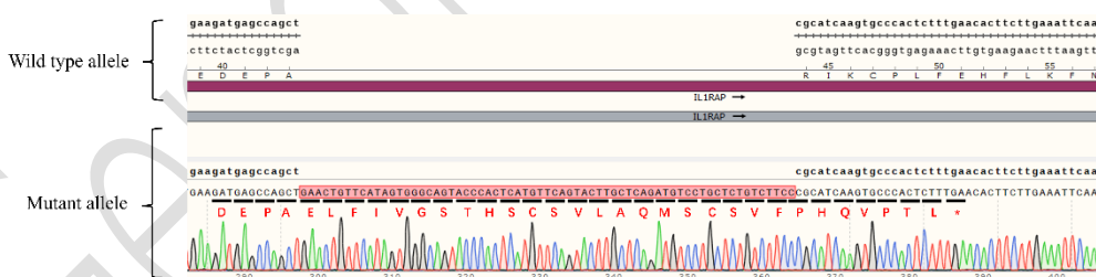
Figure 2 | The Sanger sequencing of the H_IL1RAP KO HEK-293 Cell Line showed successful knockout of IL1RAP.