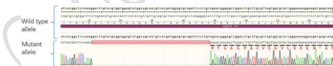
Figure 2 | The Sanger sequencing of the Mouse_PDL1 KO MC38 Cell Line showed successful knockout of PDL1.